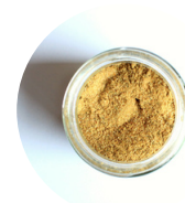
TOMATO and BASIL