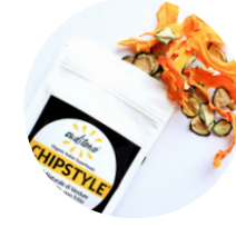
PUMPKIN and ZUCCHINI