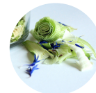
LEEKs and CHIVES