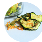
ZUCCHINI and PARSLEY