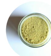
ZUCCHINI and THYME