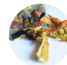
EGGPLANT and PEPPER