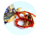
EGGPLANT, TOMATO and BASIL