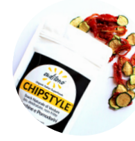
ZUCCHINI and TOMATOES