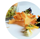
PUMKIN and CHIVES