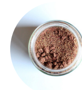
RED BEETROOT and CHILI PEPPER