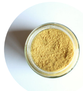
CARROT and GINGER